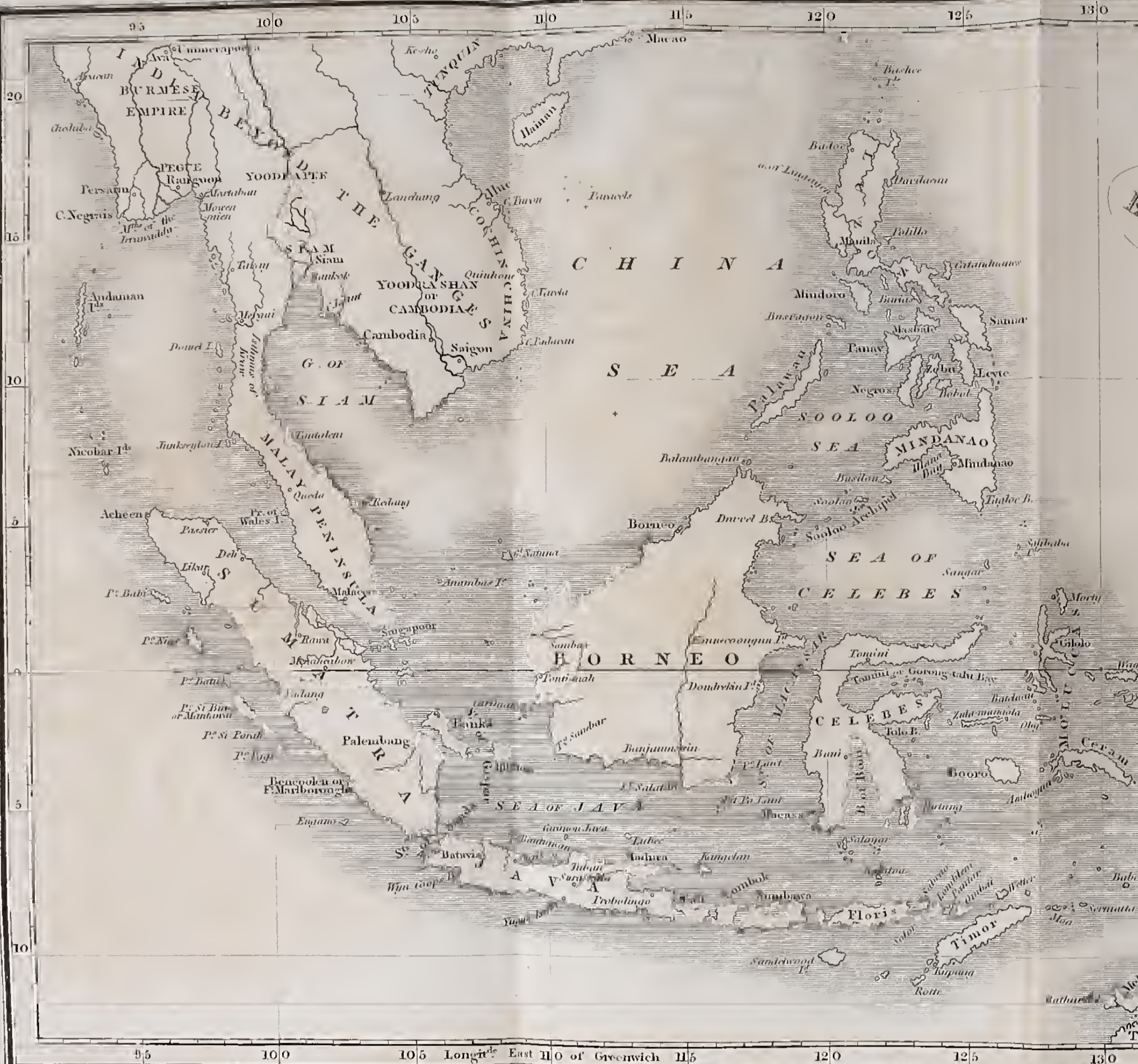
Published as the Act directs, by Purbury Allen & Co. 25 th April 1828.